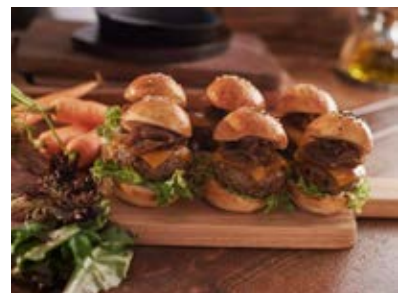
9 things to eat, see and do this weekend (Mar 4-6)