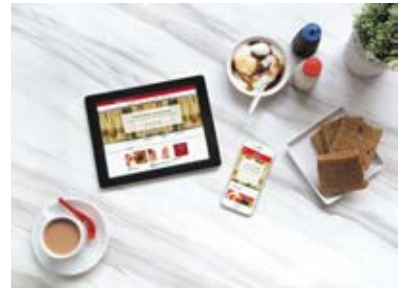
5 Things You Didn't Know About Michelin Guide Singapore