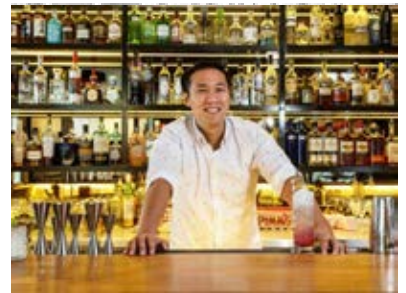
The Weekend List: 11-13 Mar 2016