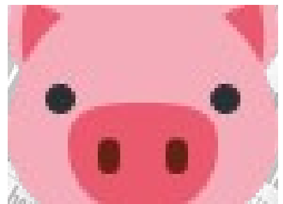
Bidding Goodbye To Five And Dime