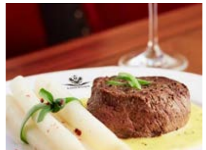
Visit Kaiserhaus For An Exquisite White Asparagus Feast