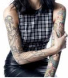
A Day In The Life of Hendrick's Gin Regional Ambassador