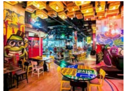
Must-trys from new gourmet 'pasar' at Suntec City