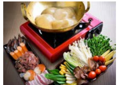
10 best places for collagen steamboat and other collagen treats