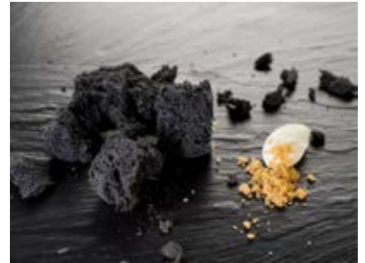
The Disgruntled Chef: Redefining Fine Dining