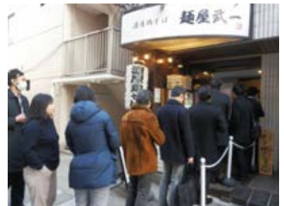
Menya Takeichi: Tokyo's number 1 chicken ramen chain now open in